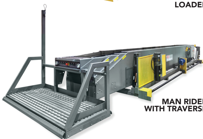
MAN RIDER WITH TRAVERSE

800.327.9209 | FMHSALES@FMHCONVEYORS.COM | WWW.FMHCONVEYORS.COM