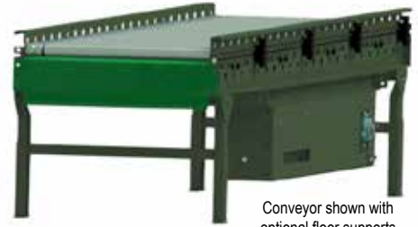
Conveyor shown with optional floor supports