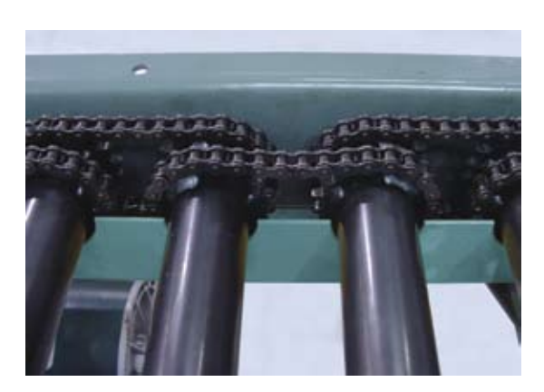
CHAIN GUARD REMOVED TO ILLUSTRATE ROLL TO ROLL DRIVE CHAIN.

WARNING: DO NOT OPERATE CONVEYOR WITH CHAIN GUARD REMOVED.